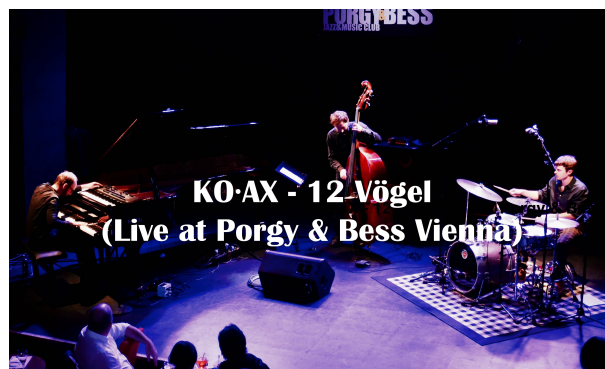
Concert recording at Porgy & Bess (2023)