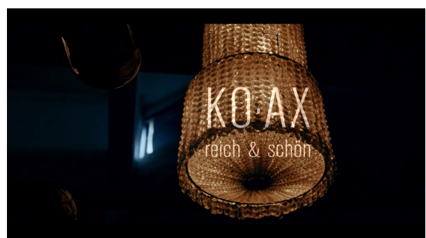
Live Recording Sessions at Treibhaus Innsbruck (2022)