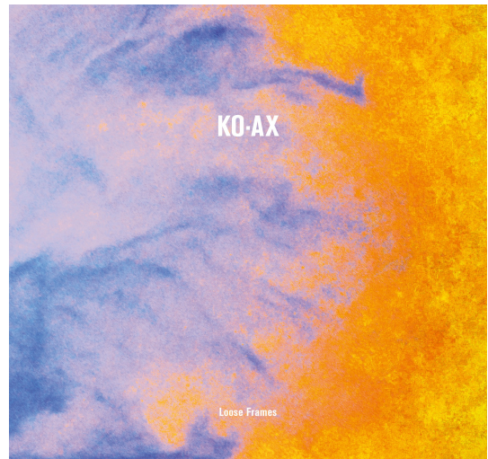
Album „Loose Frames“ (2017, Freifeld)